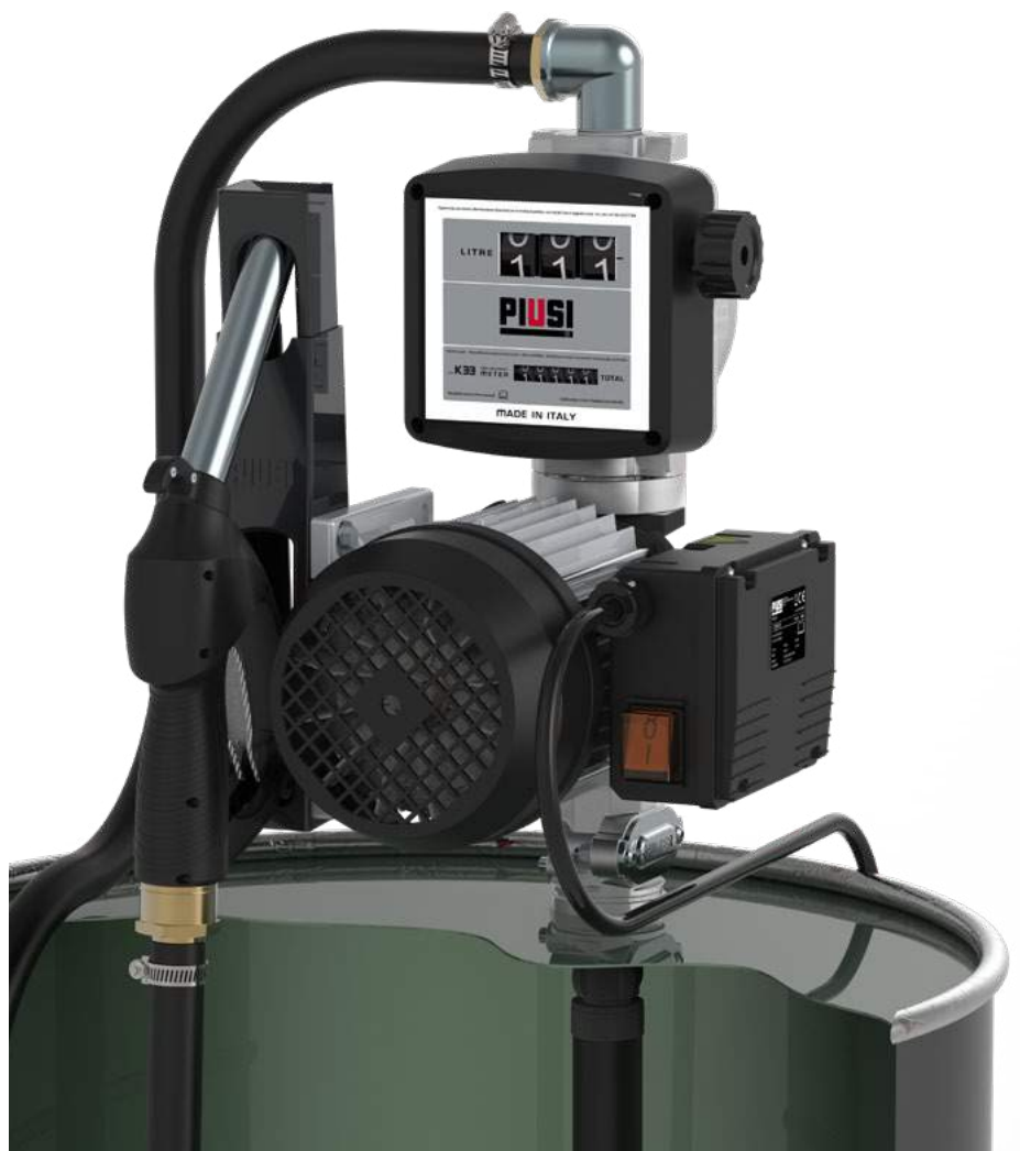
VISCOMAT VANE DRUM