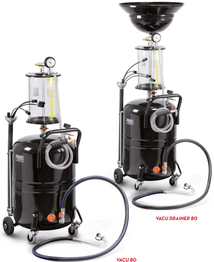
VACU DRAINER 80