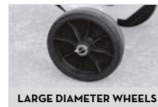
LARGE DIAMETER WHEELS